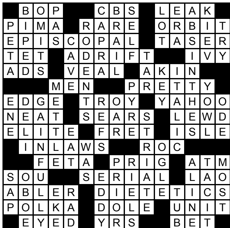
PUZZLE ANSWERS Solution to the Crossword Puzzle on page 7