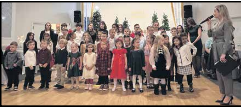
The youngest class of Lipka Academy singing Slovak Christmas carols

Branch 746 members had the opportunity to speak with Father about this plans for the parish as well as present him with a financial donation to Holy Family church. The event was a wonderful opportunity for all generations to interact and reminisce about the Slovak traditions during Christmas and concluded with a visit from Santa!