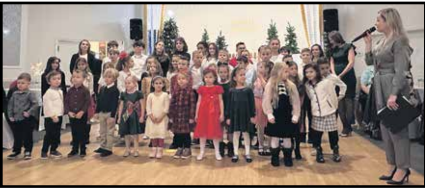
The youngest class of Lipka Academy singing Slovak Christmas carols

Branch 746 members had the opportunity to speak with Father about this plans for the parish as well as present him with a financial donation to Holy Family church. The event was a wonderful opportunity for all generations to interact and reminisce about the Slovak traditions during Christmas and concluded with a visit from Santa!