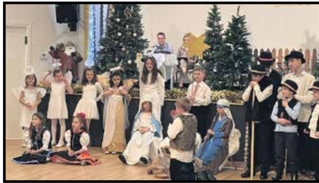
The Holy Nativity as reenacted by the children of Lipka Academy